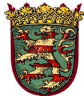
Hessen Coat of Arms

Kassel or Cassel is a city in northern Hessen, Germany. During the American Revolutionary War, Karl, Landgraf von Hesse-Kassel, Prince of the Hessen Royal Family, hired out thousands of his mercenaries to Great Britain to fight against the Americans in the Revolutionary War.