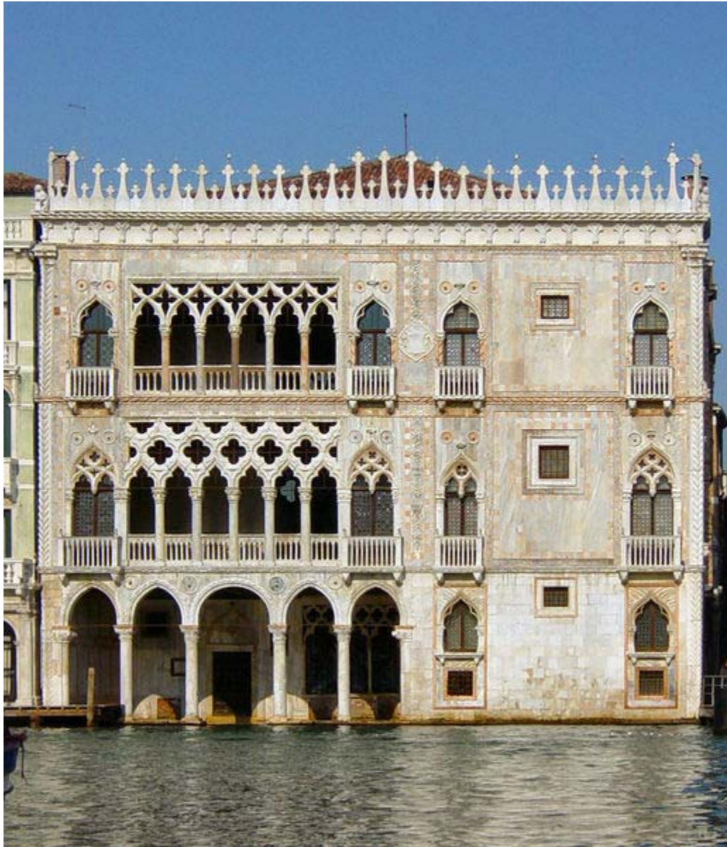
CadOro, Venice, Italy

This is the Illuminati of the left hand path – the elitist path to secure money, power, and world domination – a New World Order – their order of one world governance by the select few over the many: Weishaupt's life-long goal.