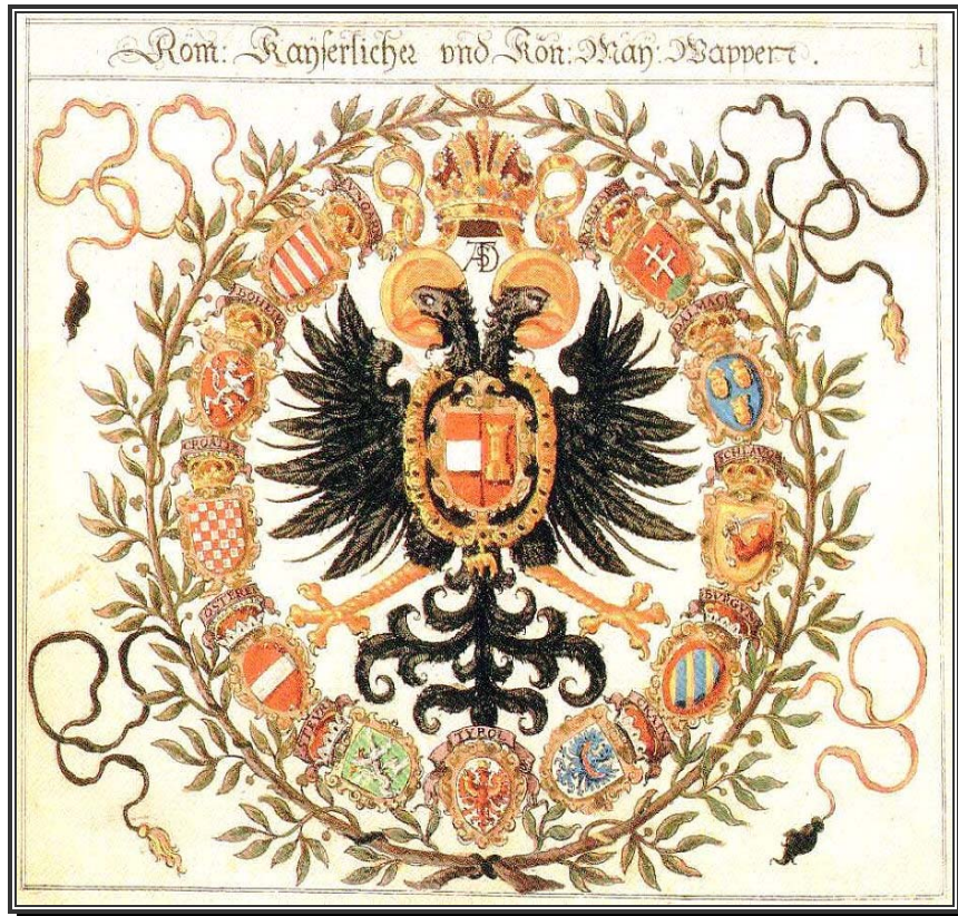
Coats of Arms of a Holy Roman Emperor

Margaret II of Avesnes was Countess of Hainaut and Countess of Holland from 1345 to 1356. Margaret was the daughter of William III of Hainaut and Holland, and his wife, Jeanne of Valois. On 26 February, 1324, in Cologne she married Emperor Louis IV of Bavaria.