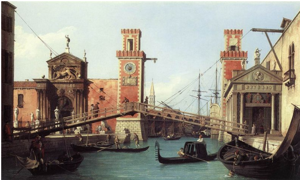
Entrance to the Arsenal by Canaletto, 1732

We have also seen how all the so called “royal” or ruling Houses of Europe were intertwined and entangled in a web of lies and deceit, whose form could only be held together by the breeding of one elite family with another, and in some instances, interbreeding within the same family. The elite banking dynasties employed the same blueblood breeding.