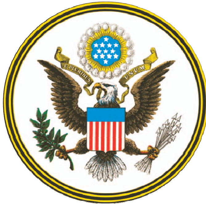
Front Face of the Great Seal