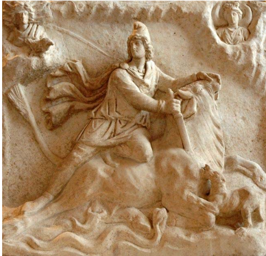
Mithras Killing a Sacred Bull