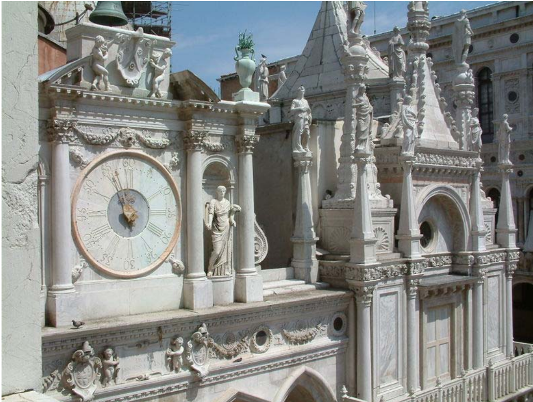
Interior Courtyard of the Doge's Palace

The Government was run by a Cabinet, consisting of the Prime Minister and the six most powerful elite members of state. The Cabinet reported to the Senate or Great Council, which included all the selected elite.