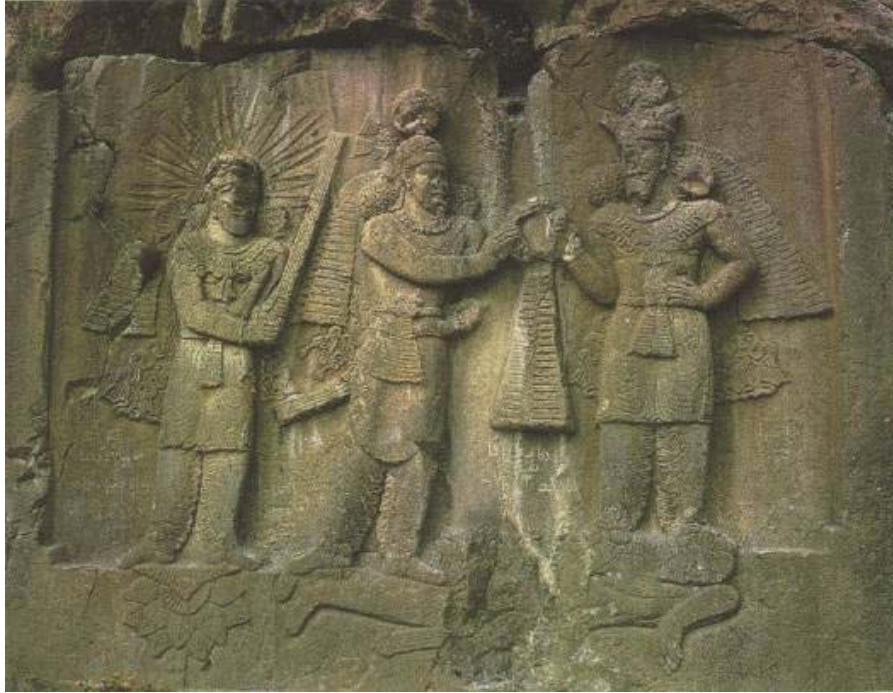
Mithra, Ardashir I, Ahura Mazda