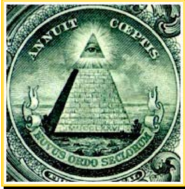
Reverse Face of the Great Seal

As Manly P. Hall stated in The Secret Teachings of All Ages :