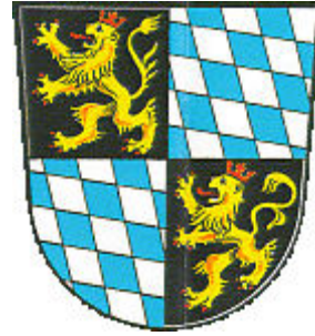
House of Wittelsbach

At the age of six, Otto was married with Agnes of Palatinate, a granddaughter of Duke Henry the Lion and Conrad of Hohenstaufen . By this marriage the Wittelsbach inherited Palatinate.